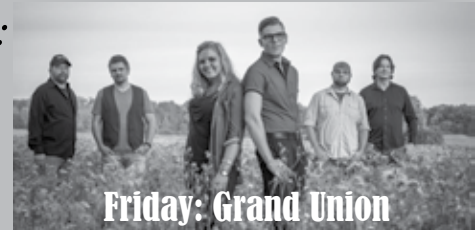
Friday: Grand Union