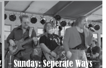
Sunday: Seperate Ways