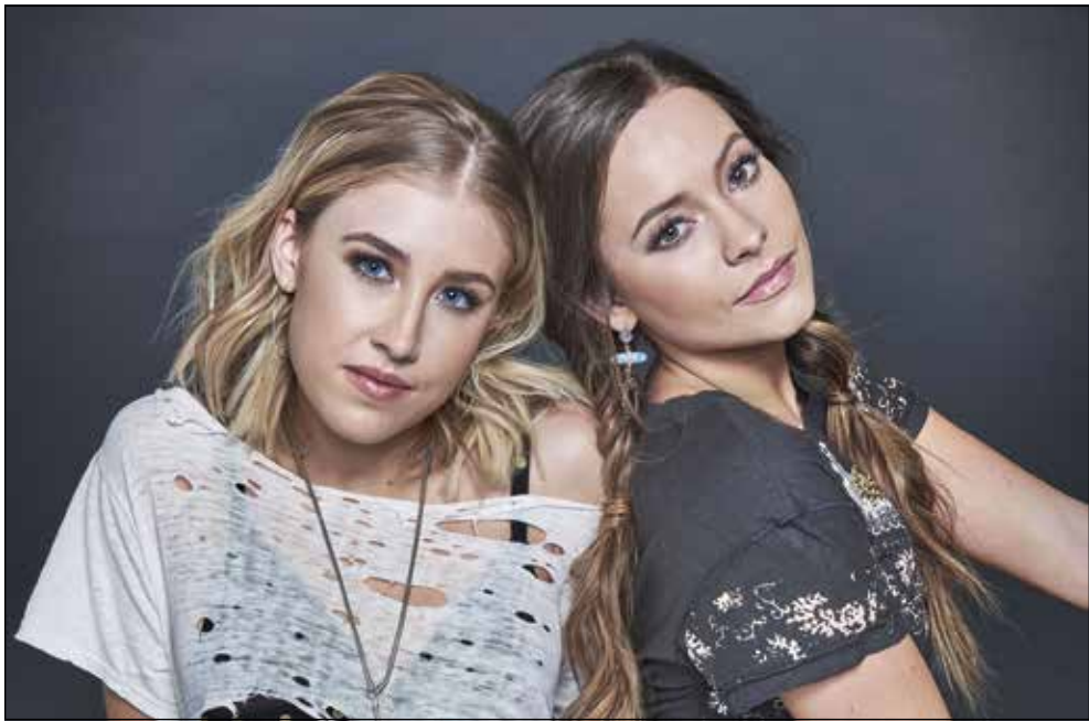
Country music stars Dustin Lynch and Maddie & Tae (below) will kick off AirVenture Oshkosh on July 23.