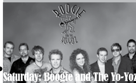
Saturday: Boogie and The Yo-Yoz