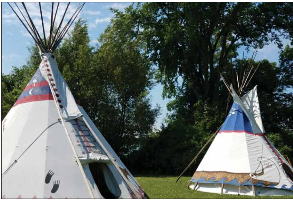
SAWDUST DAYS PHOTO