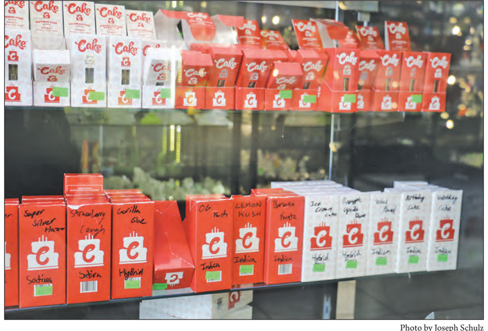
Delta-8 THC vape cartridges sit in a display case inside A-Z Tobacco & Vapor Shop.

illicit THC vapes also containing methamphetamine or the powerful synthetic fentanyl, Hilker added.